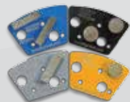
TOOLING & CONSUMABLES