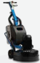
GRINDERS & POLISHERS